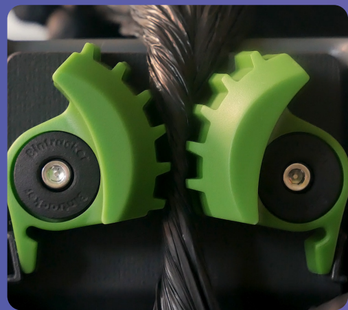
Patented Grippers are Washable and Replaceable