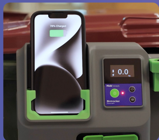
Integrated Wireless Phone Charger